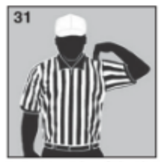
(Followed by pointing toward toe for kicking)