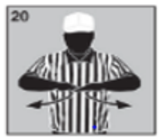
(2 hands) (1 hands) (1 hand)