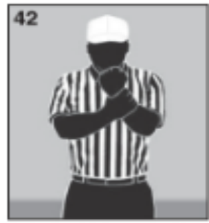
Holding/obstruction Illegal use of hands/arms